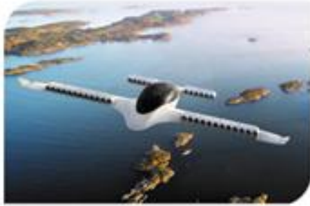
Lilium Aviation (DE) Electric vertical jet Supported by EIT Climate-KIC