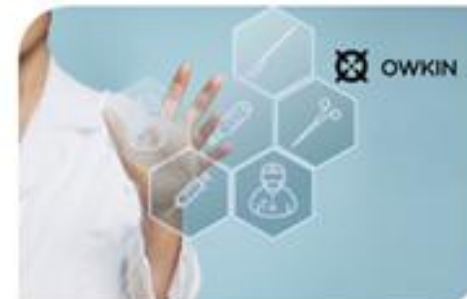
Owkin (FR) Better patient drugs by machine learning Supported by EIT Health