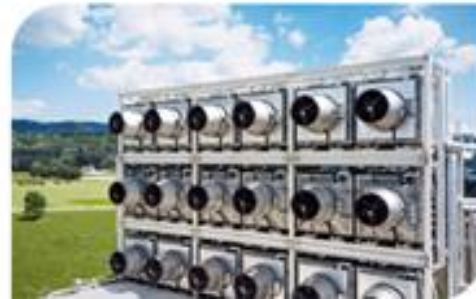
Climeoworks (CH) Carbon dioxide (CO 2 ) collectors Supported by EIT Climate-KIC