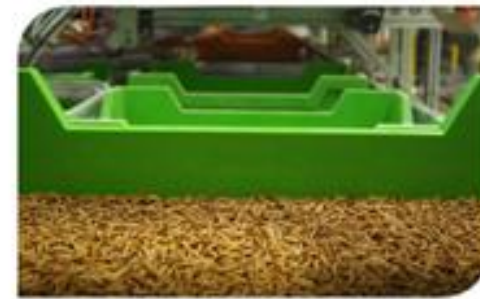
Ynsect (FR) Global leader in alternative protein production Supported by EIT Climate-KIC