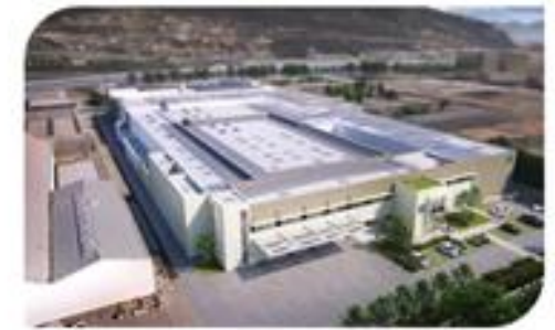
Verkor (FR) Low-carbon batteries Supported by EIT InnoEnergy