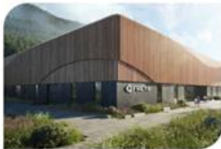
Freyr (NO) High Energy density and cost-competitive clean battery Supported by EIT InnoEnergy