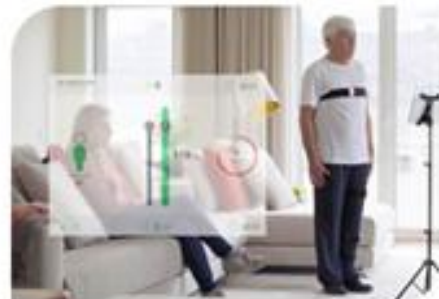
Sword Health (PT) Virtual care for patients Supported by EIT Health